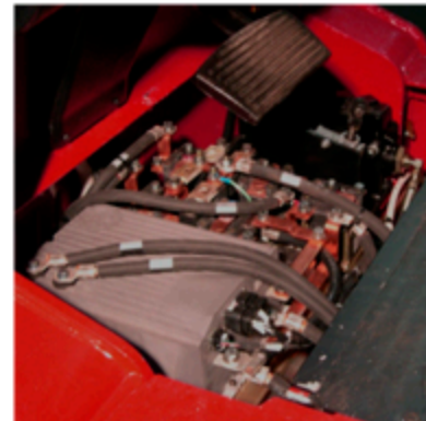
SE Series trucks are equipped with GE solid state SEM 740A separately excited microprocessor-based SCR drive motor control with on-board diagnostics.

SCHAEFF'S spacious human engineered operators compartment is designed to fit a wide range of operators for increased productivity, comfort and safety. You can count on the fact that when it comes to quality, innovation, and service SCHAEFF is pioneering the standard.